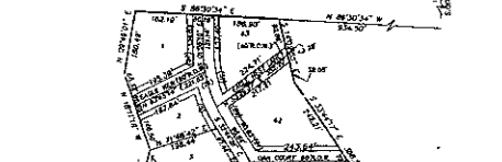
VICINITY MAP (NO SCALE)

Recorded in Public Office of Colbert County, Alabama, on this 17th day of February, 2008. Colbert C 511-145